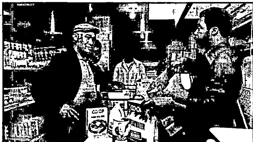
FIGURE 4.1 Martin Luther King Food Co-op.

By 1975, this broad range of cooperatives provided DC residents spaces for autonomy and control, a form of home rule. This home rule from below did not merely recreate an individualistic consumer society, but rather imagined a new society based on the common. The civil rights movement supported a wide variety of cooperatives because people, especially those marginalized from mainstream White society, could take control of their economic lives and create an alternative to individualist consumer society (Gordon Nembhard, 2014; Ransby,